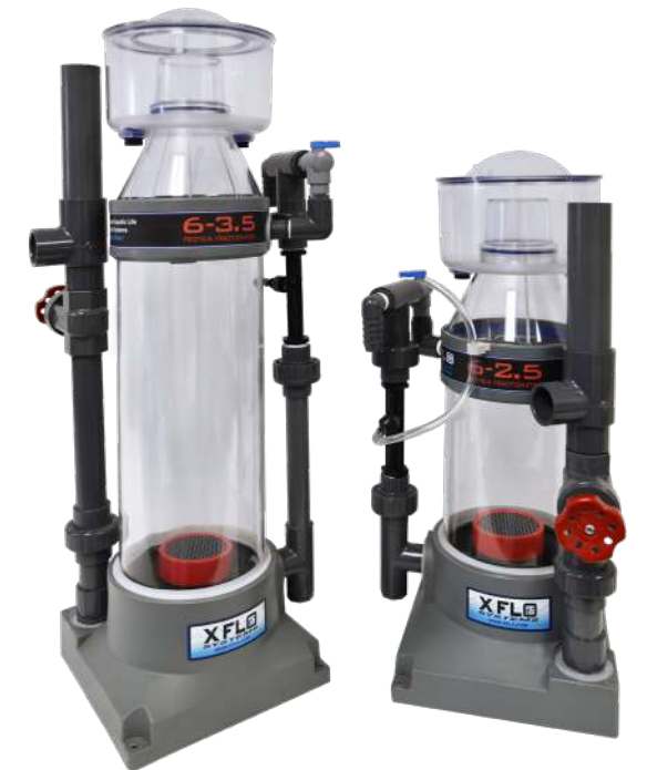
3.5 and 2.5 Venturi Models Shown

XFLO Skimmers are designed and manufactured in the USA with the highest-quality materials in the industry.